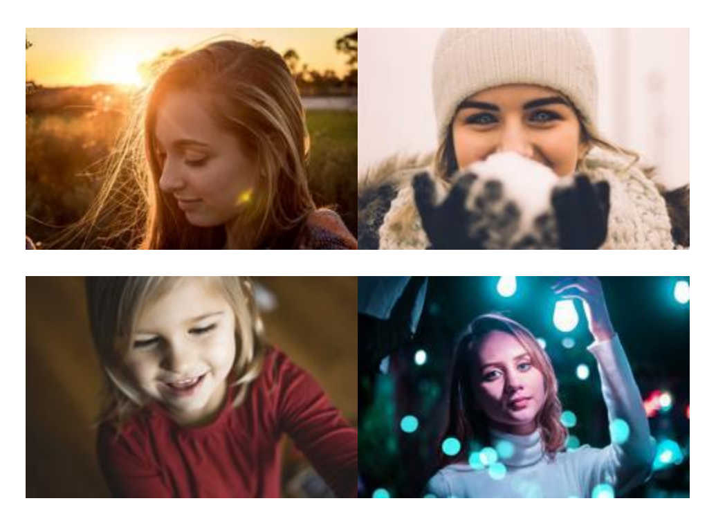
A Fashion Inspired Portraiture. It's all about you! A journey in self-discovery. A personal, customized and an absolutely beautiful experience.

Glamour Portrait - Collections Start at $150.00 - Contact Us